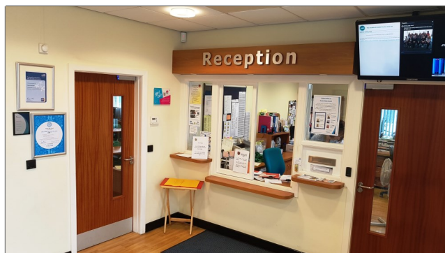
The main reception.