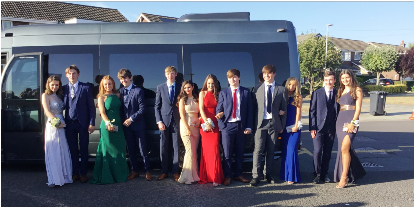
30 Years later the 2018 Prom