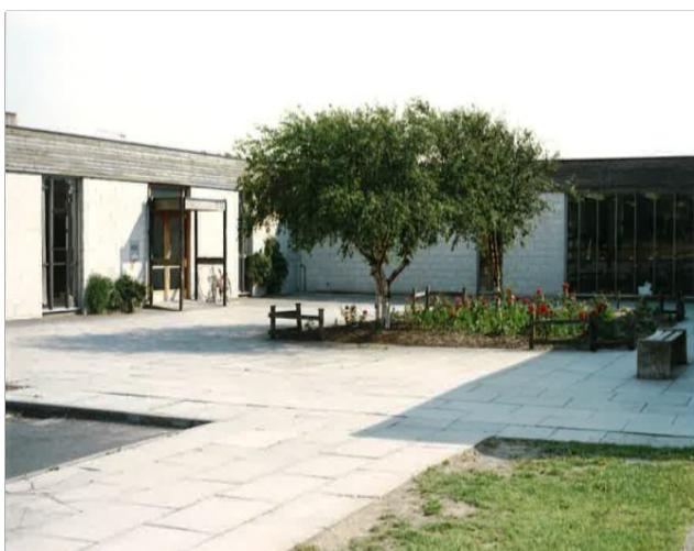
Main entrance c1975

A large extension was added in 2010 which created a spacious new reception area and a large IT classroom. The examination office now sits on the site of the original reception area.