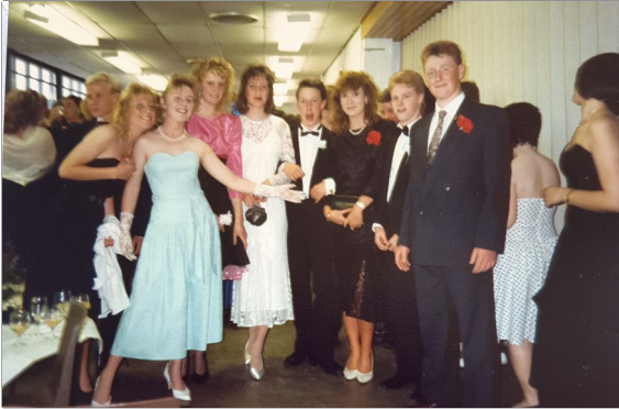
Students celebrating at the 1988 Prom

The school prom was first introduced in 1988 and has been the highlight of the year for those students in Y11 ever since.