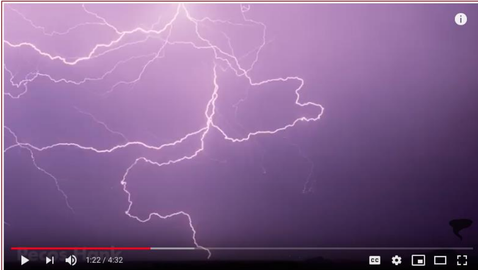
STRANGE LIGHTNING STRIKES - Caught on Camera and explained